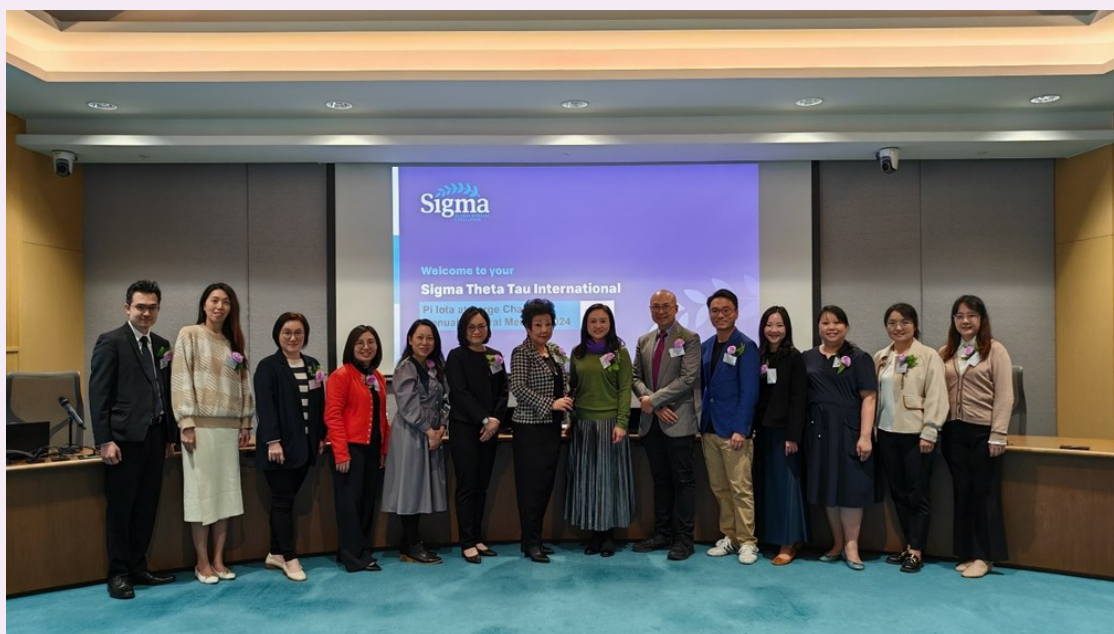
Group photo with Board Members at the Annual General Meeting

The event concluded with a sense of unity and purpose, as members left inspired to contribute to the ongoing advancement of nursing practice. We look forward to the year ahead, filled with opportunities for collaboration, growth, and service within our vibrant nursing community.