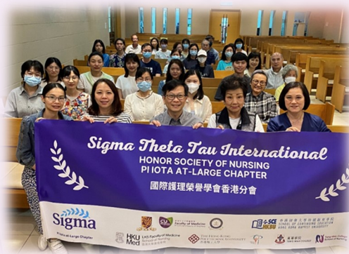
A group photo of Board Members, the Speaker, and participants.