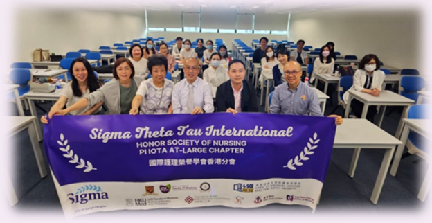
A group photo of Board Members, the Speakers, and participants.