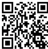
Our Facebook Page

Want to know more about our Chapter? Please LIKE and FOLLOW our Facebook page and Instagram.