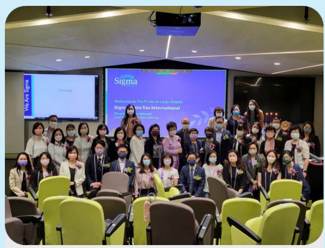
A picture of Heads of Institutes of the five schools of Nursing, past presidents of Pi lota Chapter, newly inducted Board Members, and inductees.