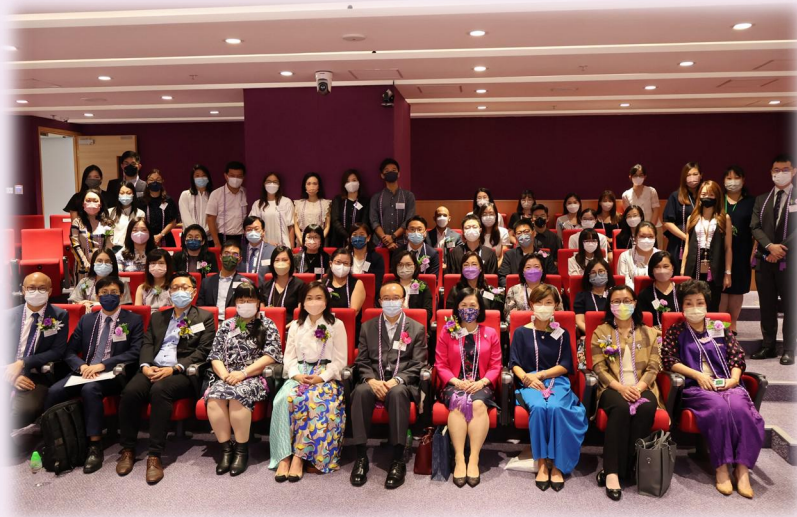
A photo of the invited guests, board members, members and new inductees