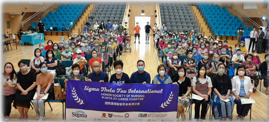
A group photo of PIAC members, nurse consultants, advanced practice nurses and participants.

The PIAC held a health talk on 17 September 2022 at the Sai Kung Jockey Club Town Hall. The theme of the talk was 'Know More About Frequent Urination, Urine Leakage and Constipation'. The talk consisted of preventive measures of urinary Incontinence and constipation and educated older people and their family members about symptoms of urologic disorders. More than 130 participants joined this event. In this event, we invited a team of Nurse Consultants and Advanced Practice Nurses specialized in incontinence care and constipation to provide health talk, screening and individual consultation to the participants. We would like to express our gratitude to the three sponsors who provided their generous support to us.