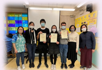
A group photo of PIAC members, speakers and student volunteers.