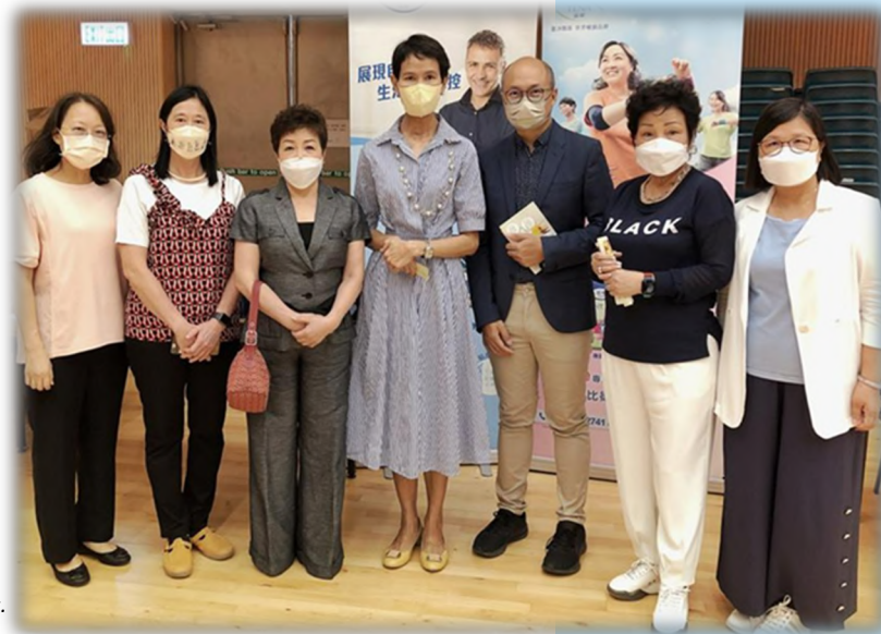
A group photo of PIAC members and speakers.