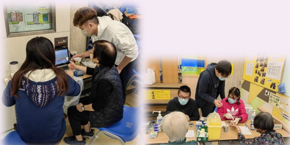
Volunteers were conducting blood glucose, cholesterol and bone intensity tests.